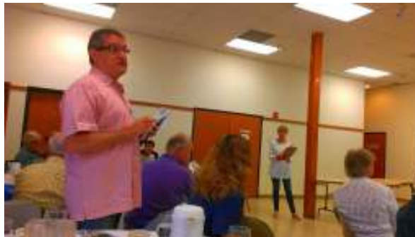
Silverthorne: Celebrating 20 Years!