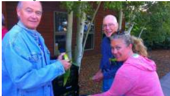
Come to the Zone Conference!