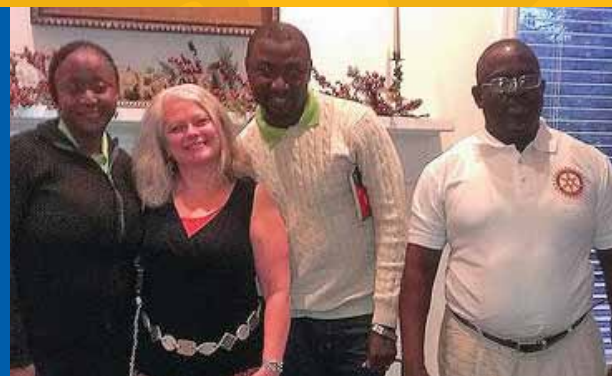
Learn about other cultures and foster peace.