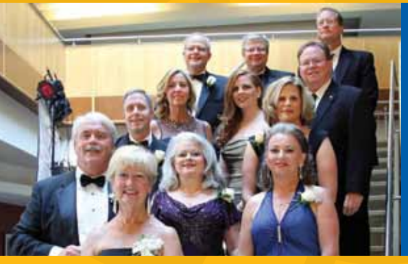
Join the top professionals in Kettering.