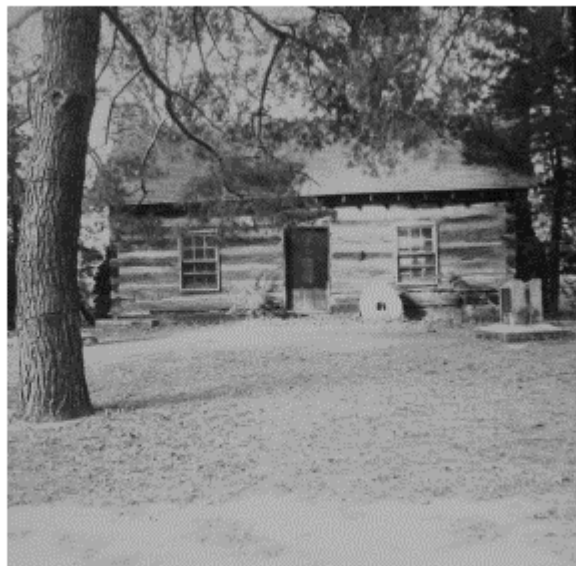
Pioneer Log Cabin, Manhattan City Park After World War II