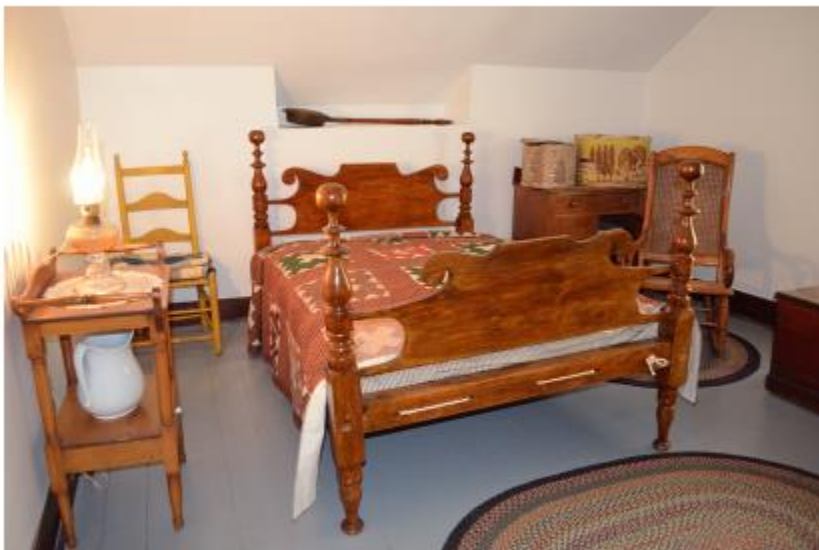
Goodnow House bedroom