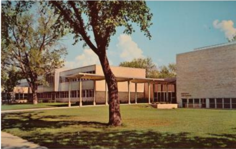
Manhattan City Hall Post Card