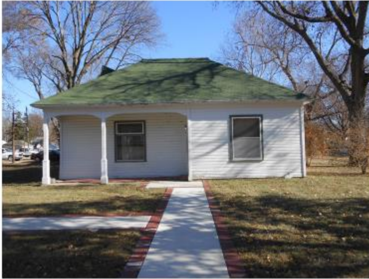
Wolf Photography Studio 2014