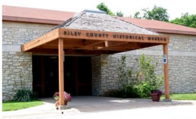
Riley County Historical Museum 2309 Claflin Road

Open 8:30 to 5:00 Tuesday to Friday Saturday and Sunday 2 to 5 Archive open by appointment Admission Free