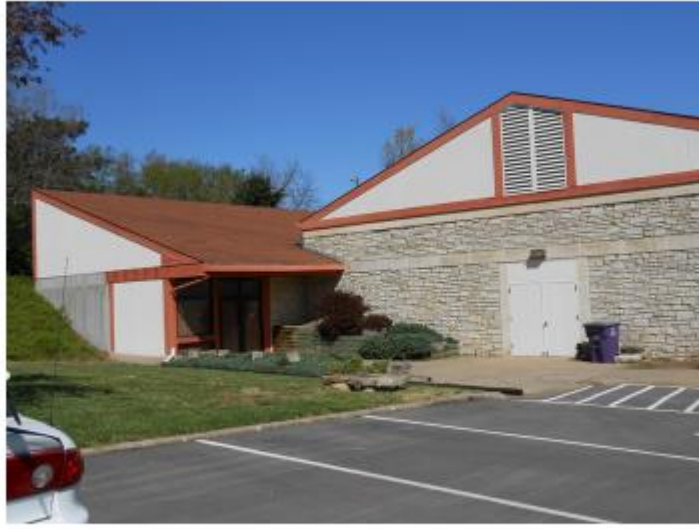
Riley County Historical Museum addition (to left) 2016 Dedicated December 6, 1987