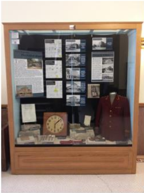
Gillett Hotel exhibit Riley County Courthouse