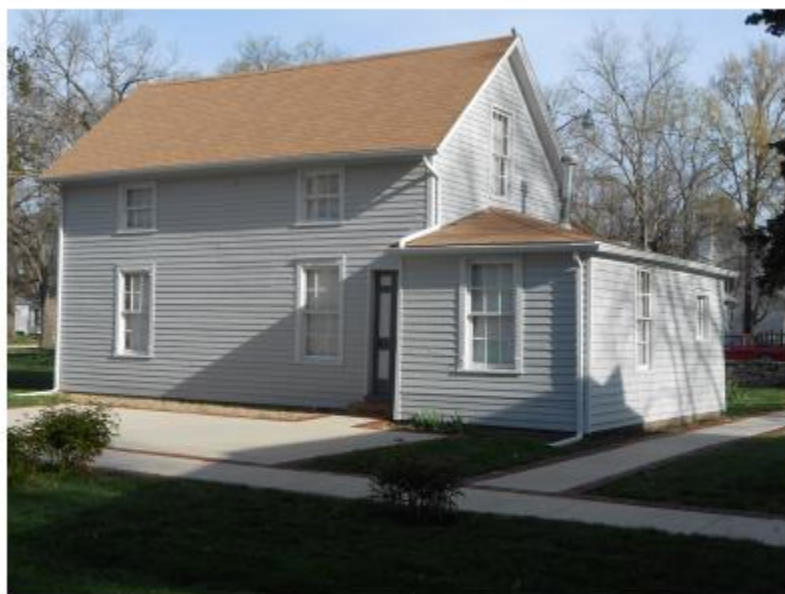
Moses House, built by Miss Flora Moses 1870