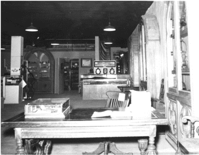
Riley County Historical Museum, Basement of City Hall