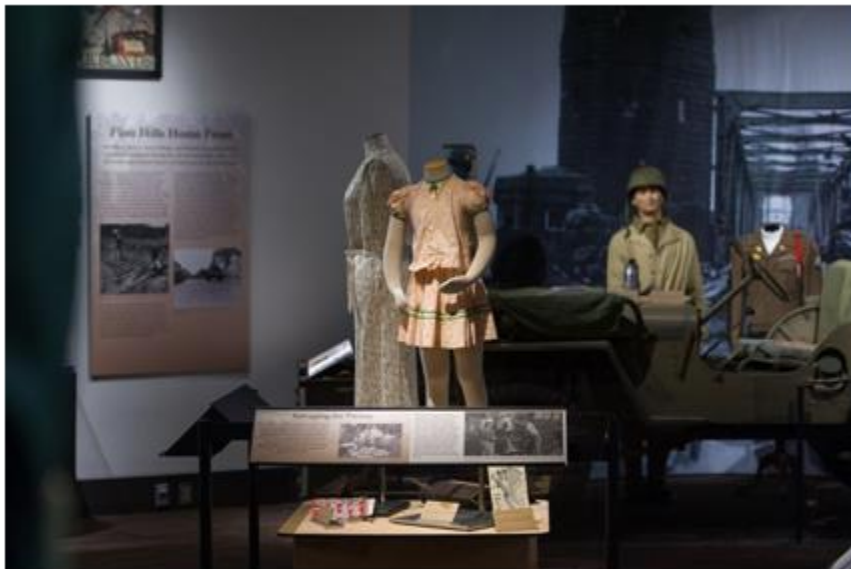
Flint Hills Discovery Center Exhibit "Flint Hills Forces II: Our Town, Our Fort, Our University 1917 – 1963" 2014