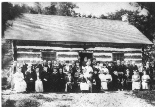
Dedication of the Pioneer Log Cabin, Manhattan City Park October 1916