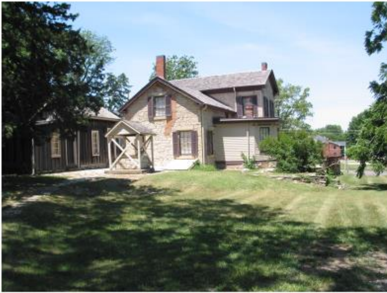
Goodnow House State Historic Site 2012