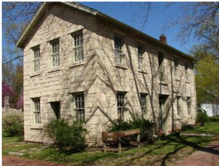
Wolf House Museum 2010