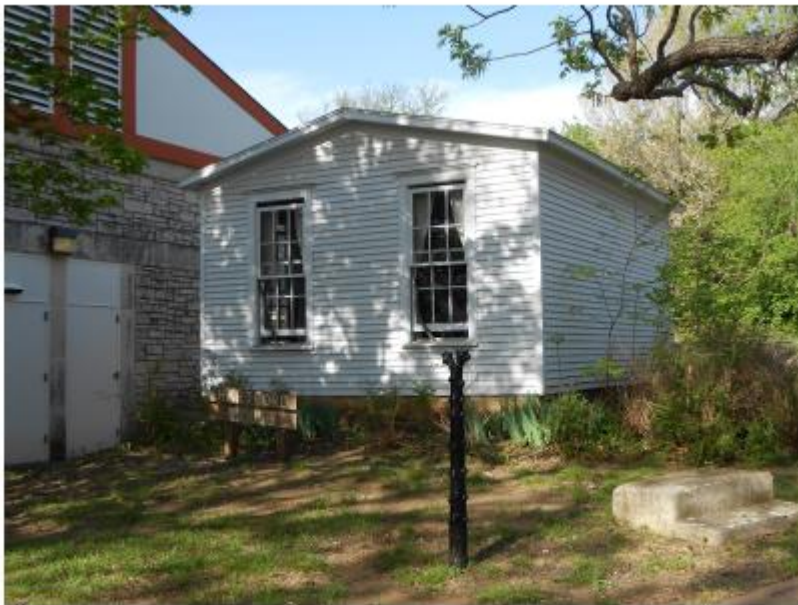
Hartford House Came on the Hartford Steamboat, 1855