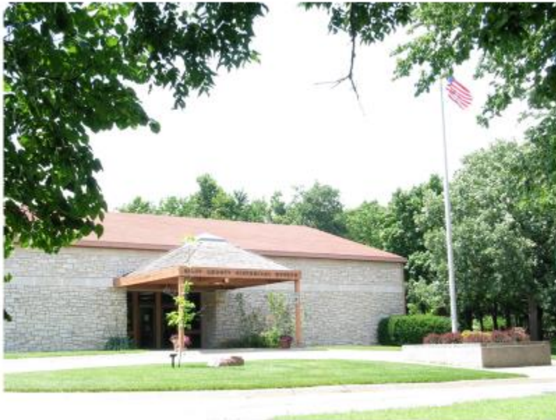
Riley County Historical Museum, 2008