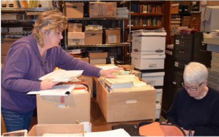
Charlson-Taylor Archive/Fay and Dora Seaton Library