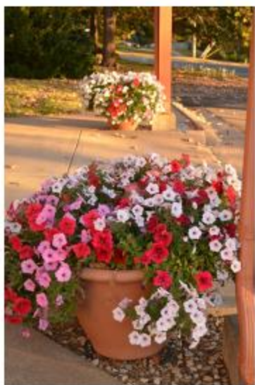
Museum flowers Maintained by the Town and Country Garden Club Since 1977