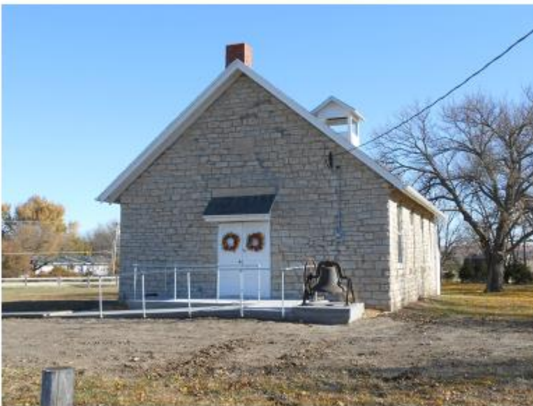
Rocky Ford School 2013