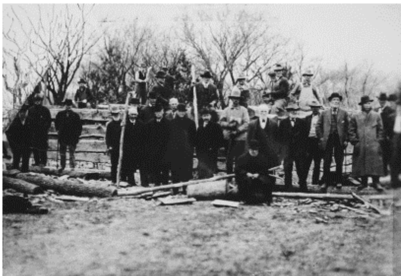
Riley County Historical Society building the Log Cabin late 1915 or early 1916