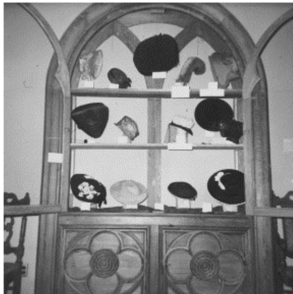
Cyprus Case, basement of Manhattan City Hall

Mrs. Max Wolf bought 6 cases in New Orleans, sold 1 and used the funds to ship the other 5 to Manhattan.