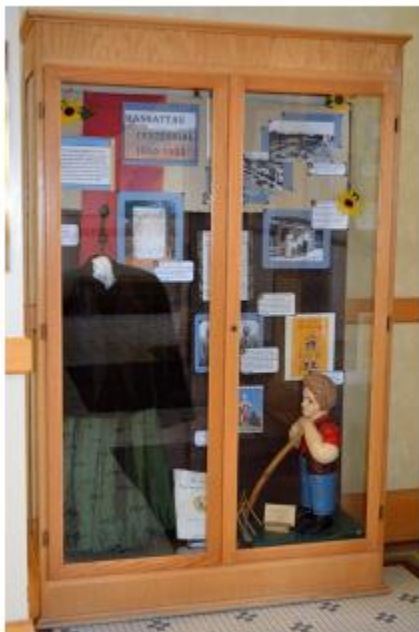
Manhattan Centennial Exhibit Riley County Office Building