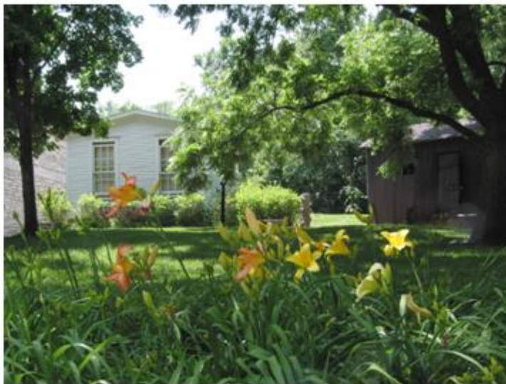
L to R: Hartford House, Randolph Jail 2012