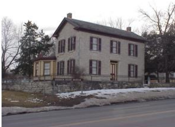
Goodnow House State Historic Site built 1861