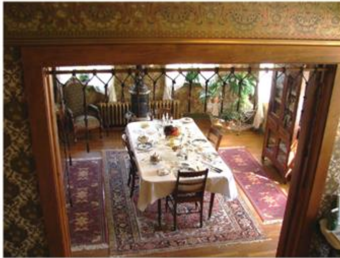
Wolf House dining room 2010