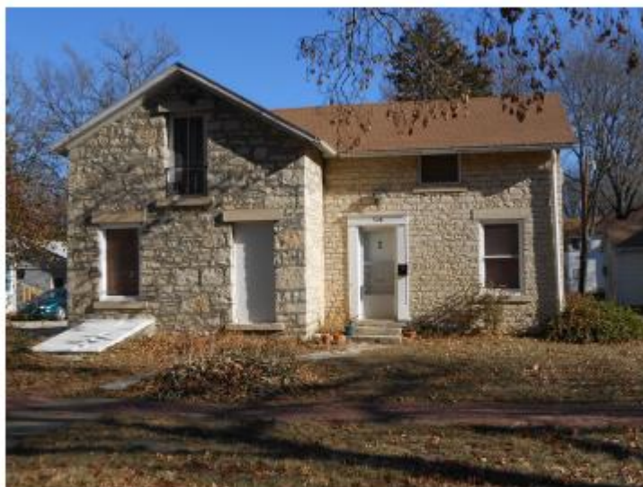
Mansfield House, 508 N. Juliette 2014