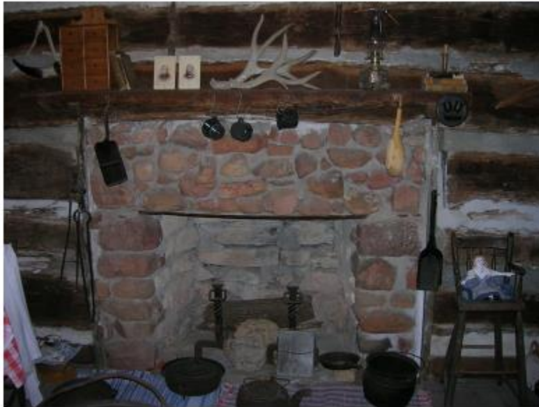
Pioneer Log Cabin, City Park 2006