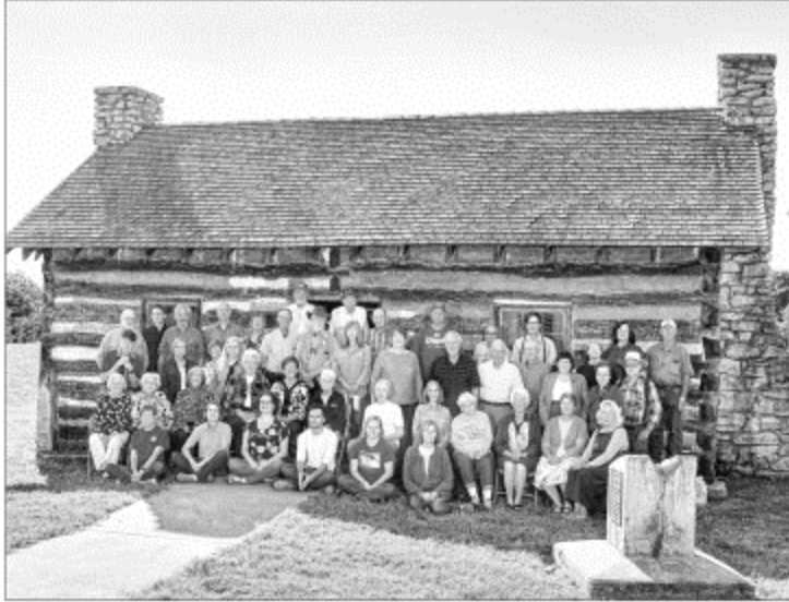
Riley County Historical Museum Centennial Celebration October 2, 2016