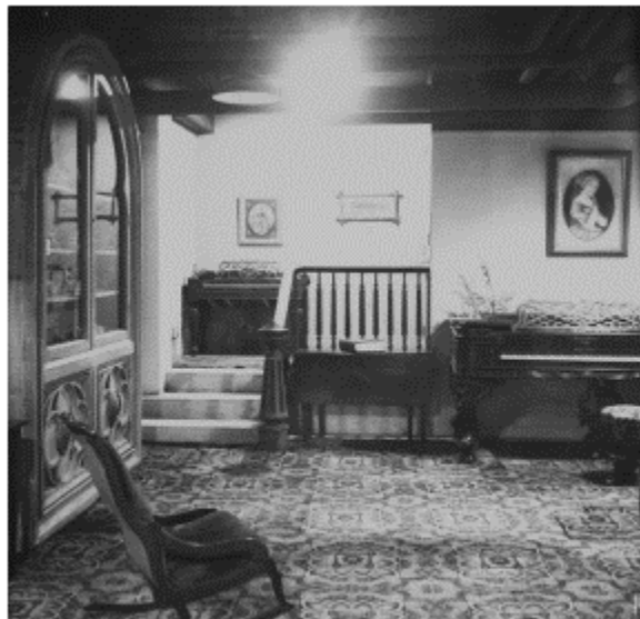
Riley County Historical Museum Basement of Manhattan City Hall