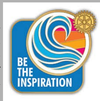
2018-2019 Rotary Theme