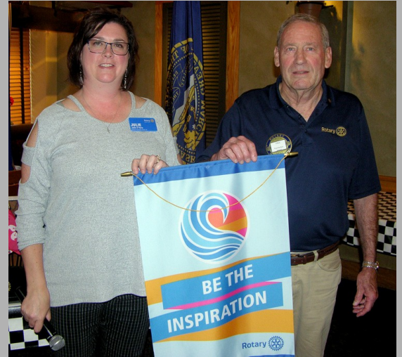
Presentation of 18-19 Theme Banner