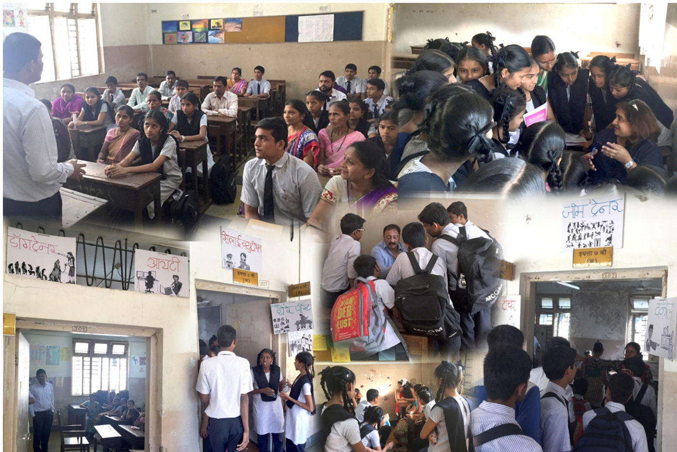
Job Fair at Sanyas Ashram School