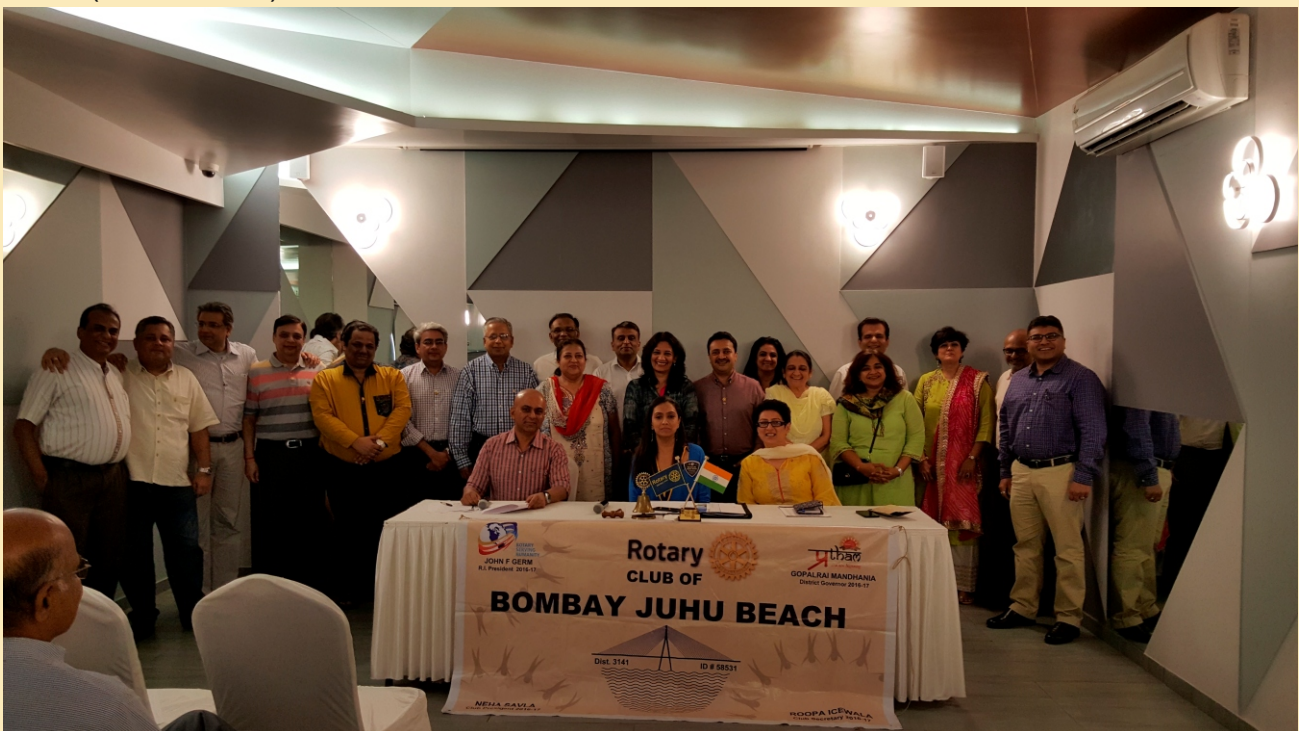
RCBJB STAR Team 2017-18 at AGM