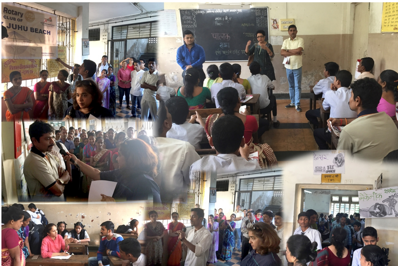
Job Fair at Sanyas Ashram School