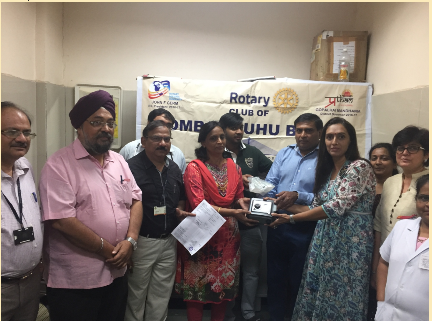
Providing BiPAP Ventilation for respiratory distress at Cooper Hospital