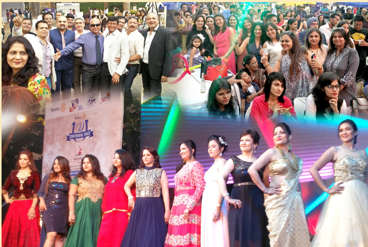
TRF Centennial Celebration - Race Day at Mahalaxmi Race Course