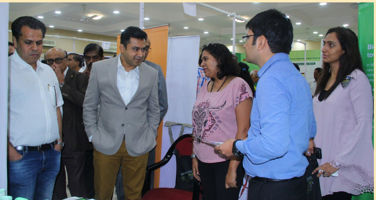
Swachh Mumbai Seminar with eminent Speakers from Excel Industries, MCGM, IIT, Director of NEERI, etc