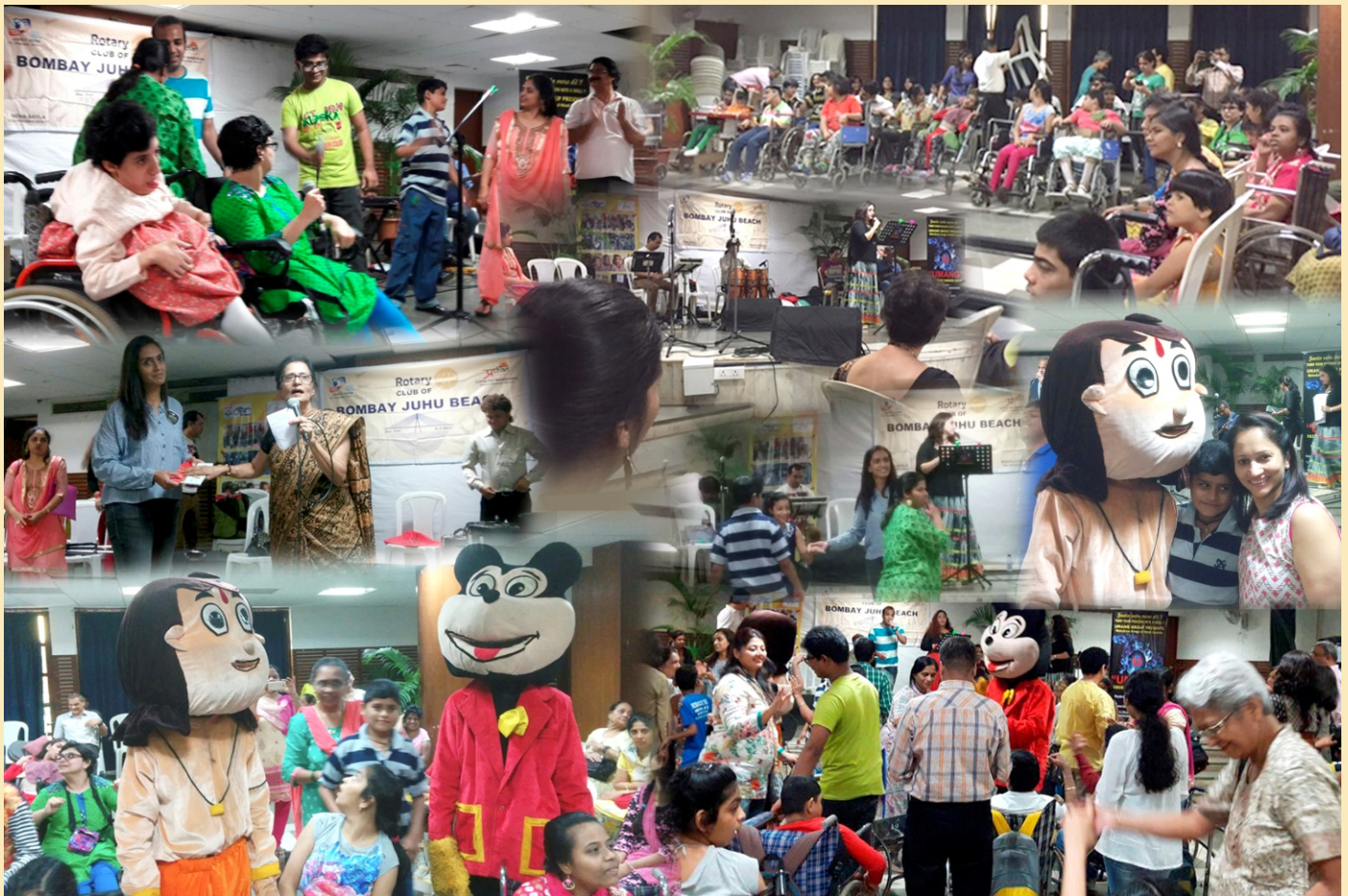
Children's Day Celebration at the Spastic Society