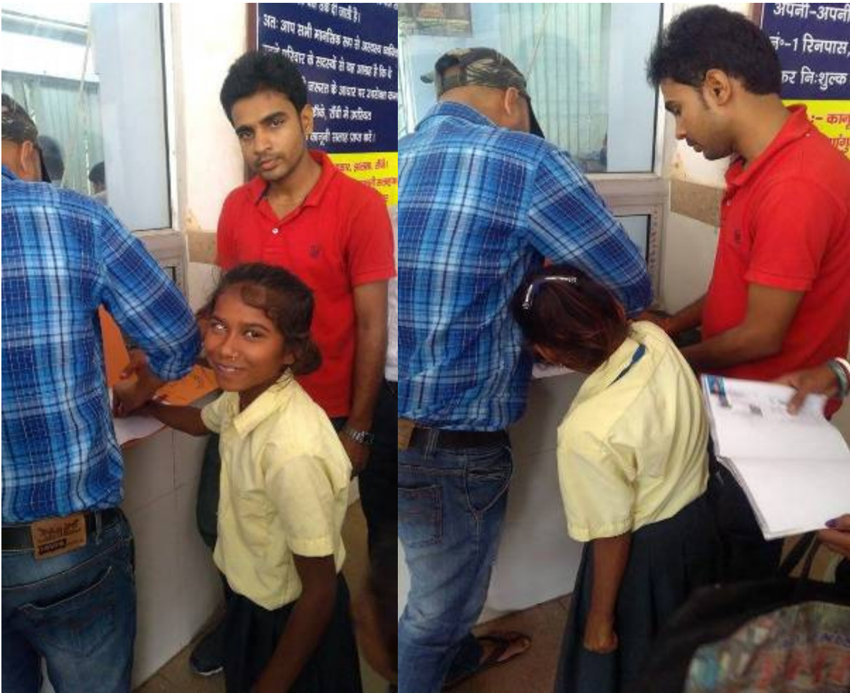
A girl with special needs of Bodhi Tree Special School at RINPAS undergoing evaluation and assessment