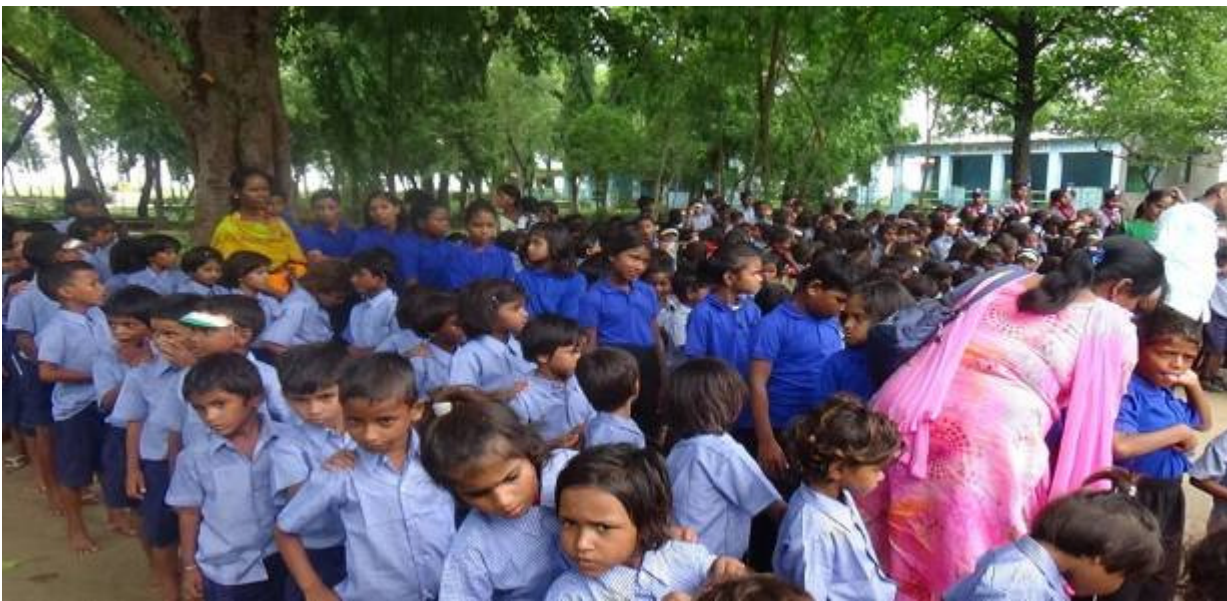
Children with Special needs in Blue T Shirt joined Flag Hoisting with normal children