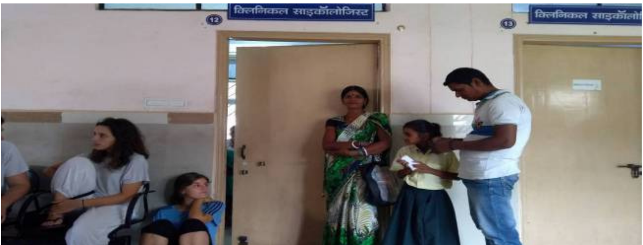
A special child is waiting for her turn at clinical psychologist under evaluation and assessment