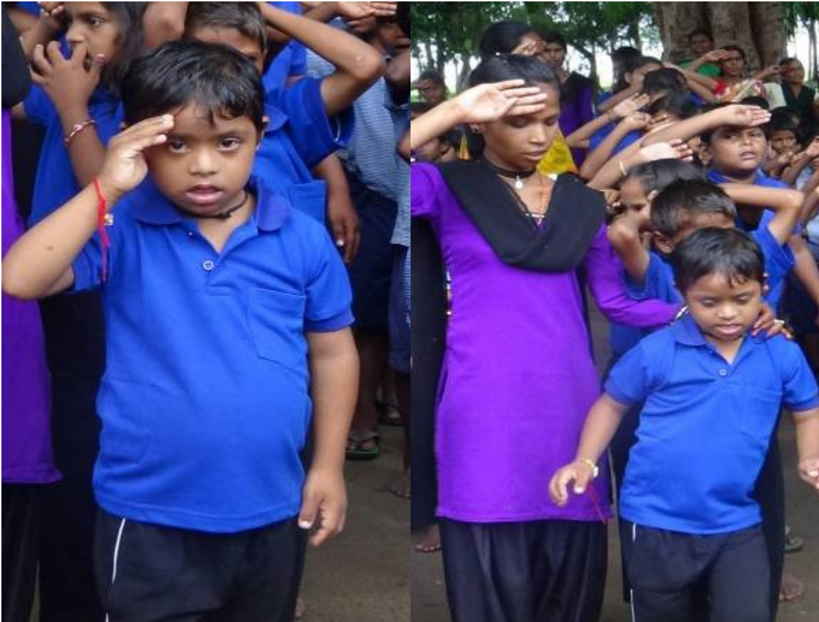
Special Children in their House T shirts