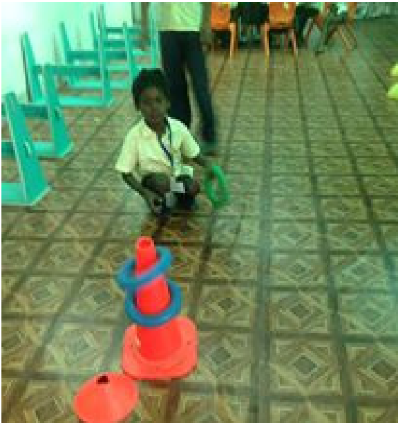
Indoor Games and mobility