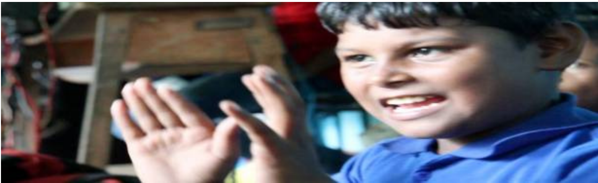
Prince With Development Disability in house dress