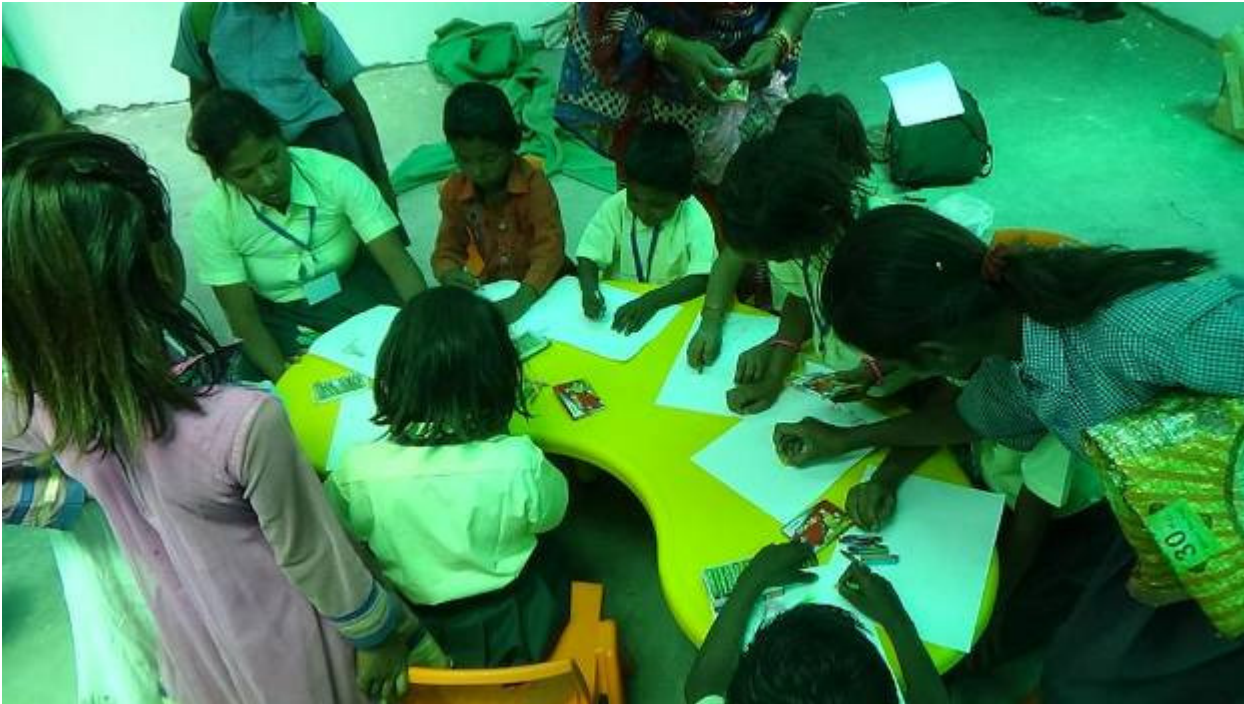
Children with special needs are encouraged to paint