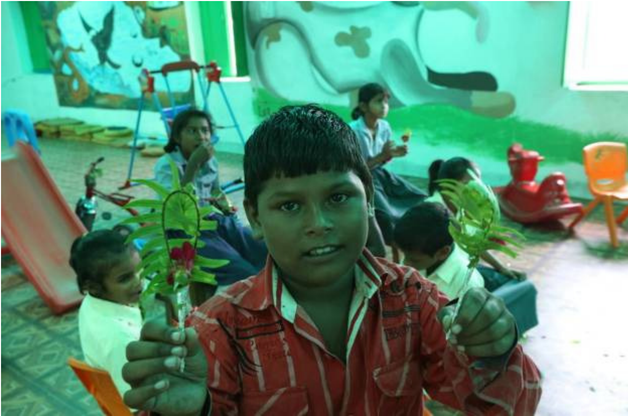
Rose Day celebration at special school