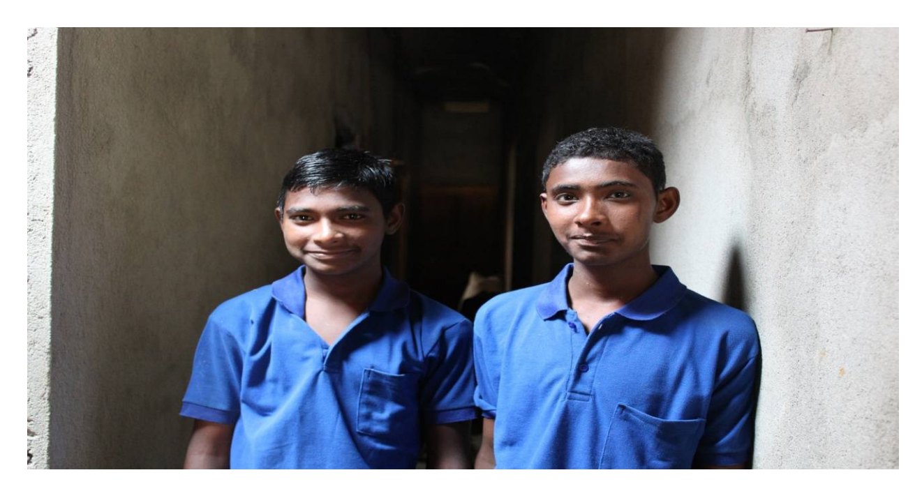
Prince is now a normal child and wants to be a doctor: Good bye mental challenge