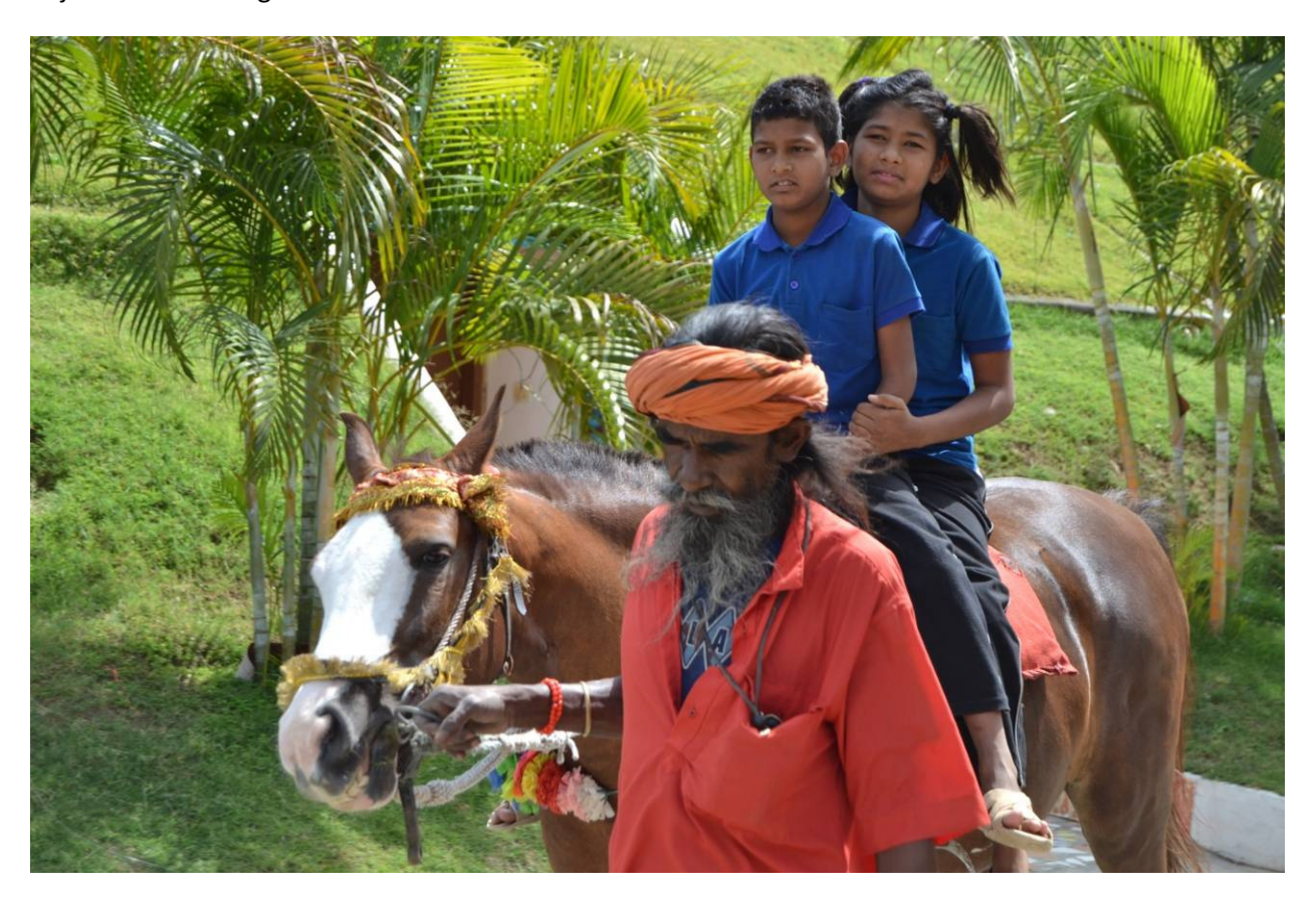
Kajal at Diversity park with another girl with mental health challenges