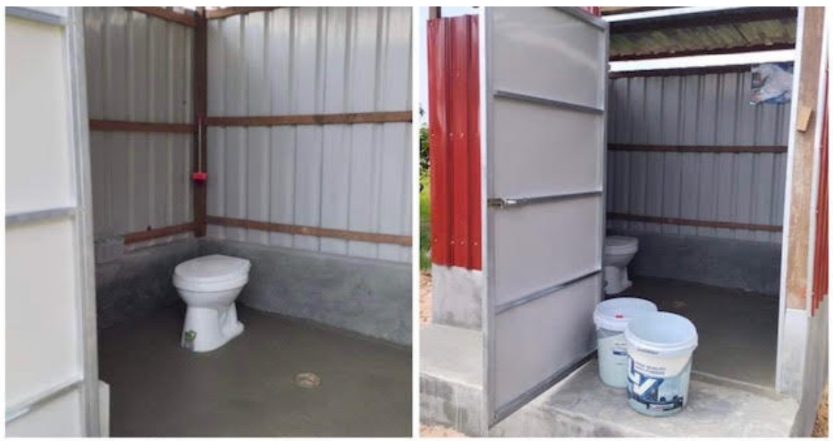
The washroom toilet has room for a wheelchair and a ramp can be added later.