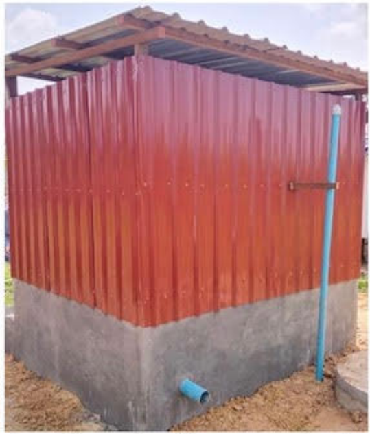
The height above ground is to allow for heavy rain in the wet season.