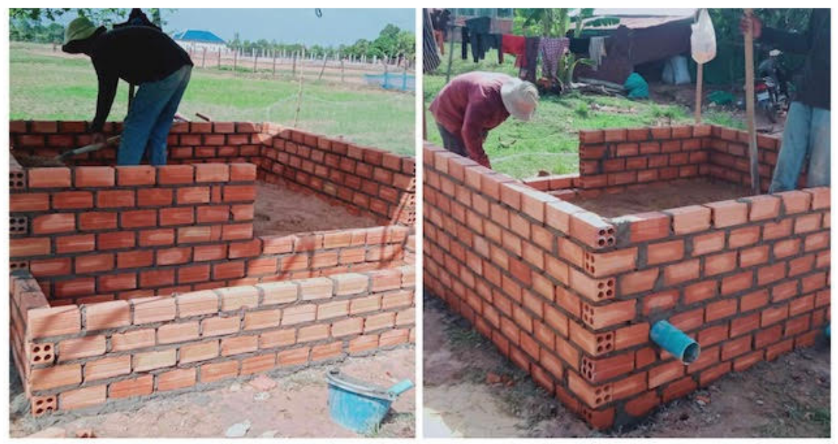
Building a brickwork base for the washroom toilet.