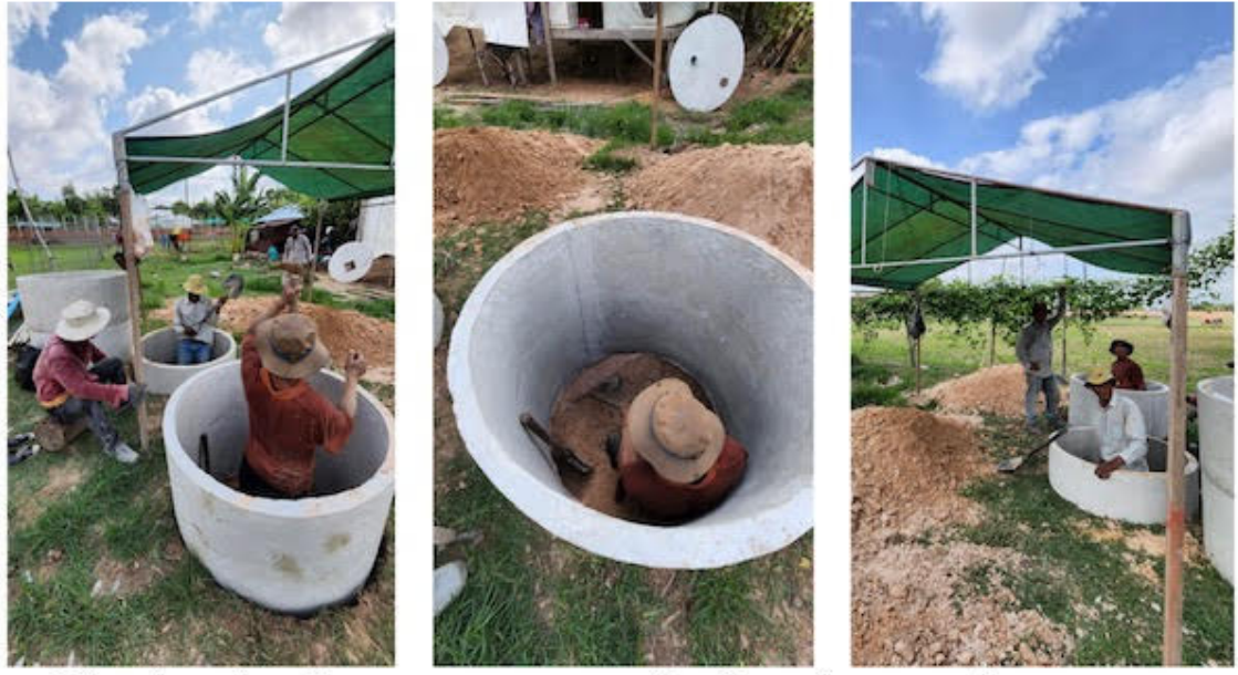
Digging in the concrete tanks for the septic system.