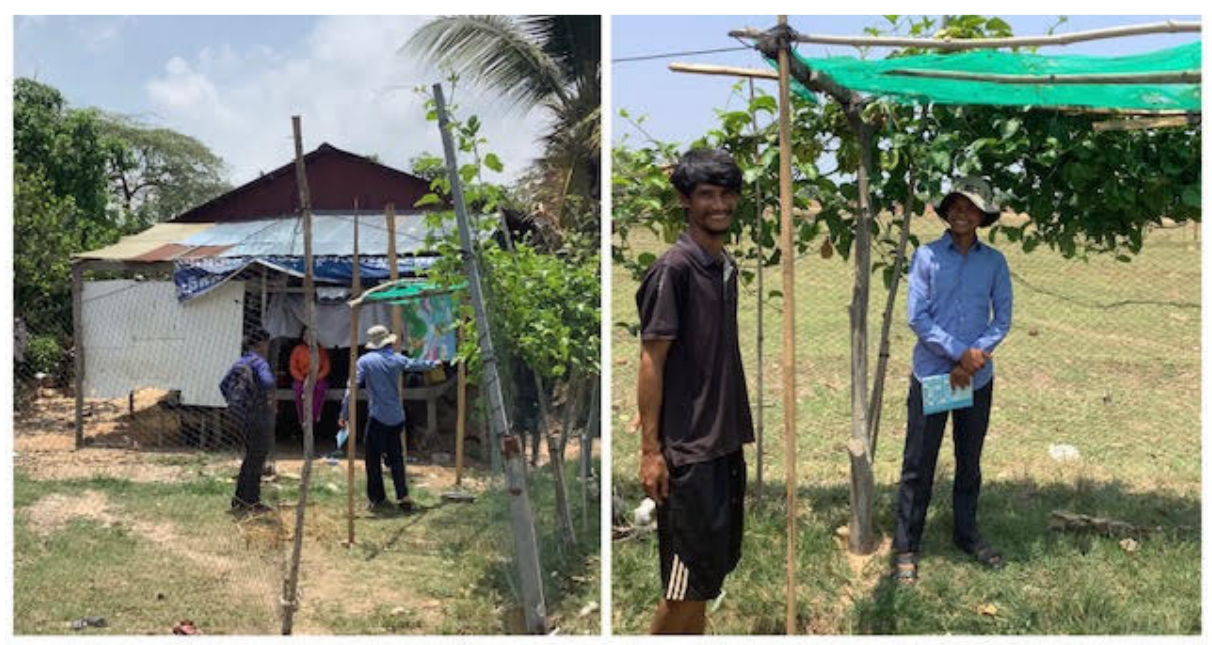
Discussions about where to have the washroom toilet.