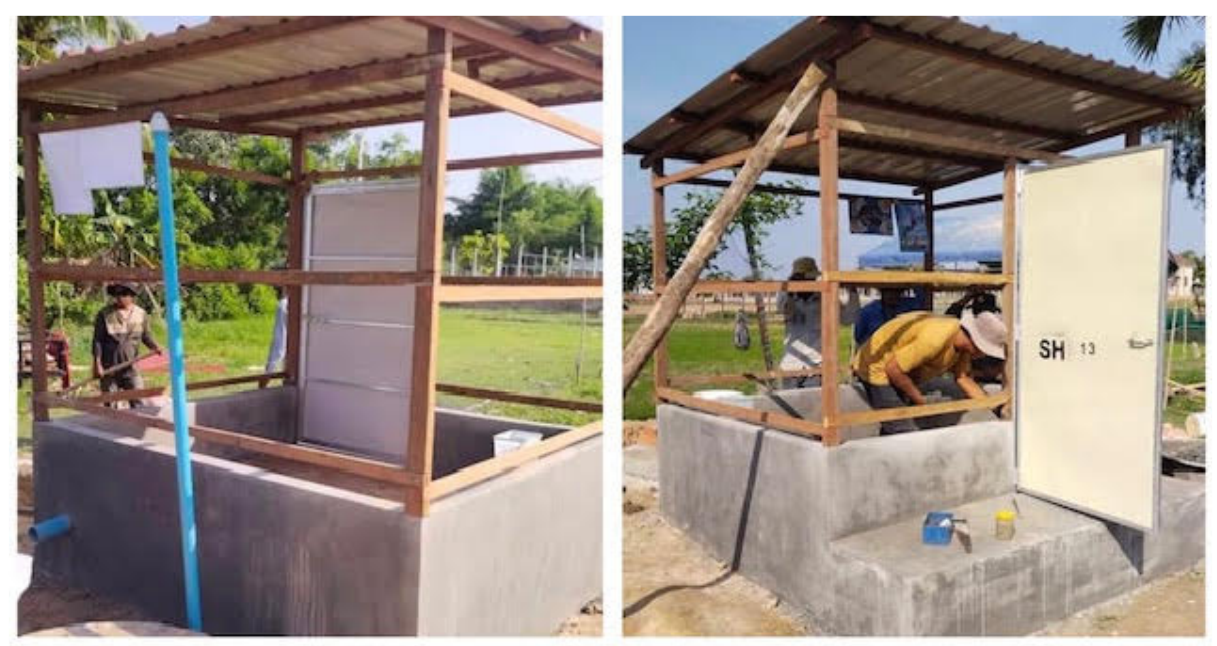
The construction ensures a place of privacy, safety and dignity.