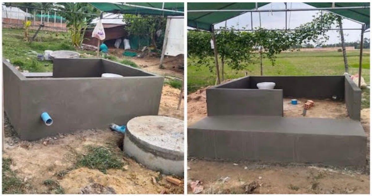
Rendering the brickwork ensures a waterproof washroom base.