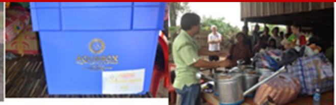
12 months of clean water courtesy of Aquabox