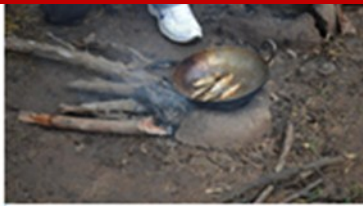
The total protein source for a family of 5 for a whole day

WE NEED TO FILL IT FOR CAMBODIA..QUICKLY