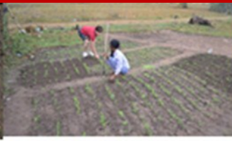
The seeds planted and growing