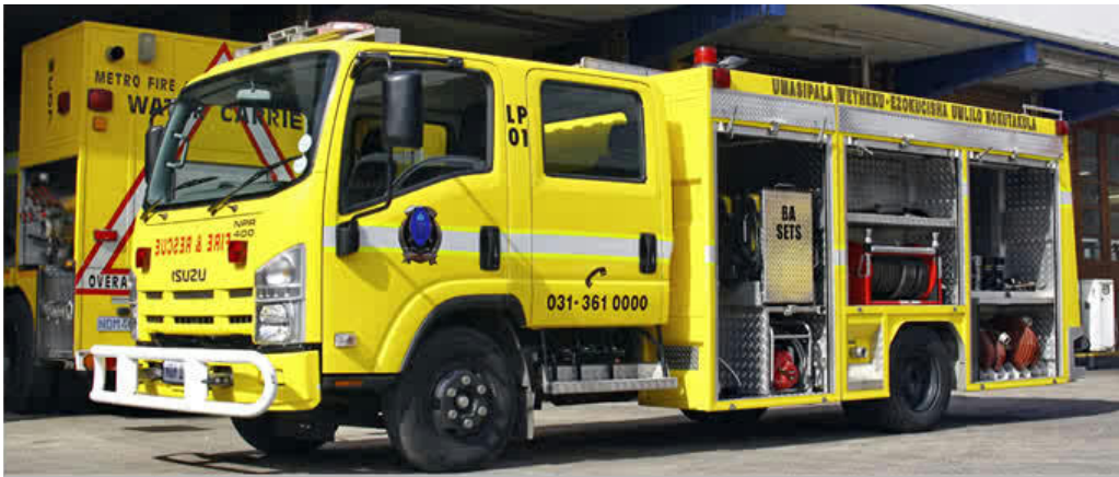
Photo of a vehicle similar to the one planned to support local needs

People's lives are under constant threat and many lose all of their meagre possessions and are badly burned (especially children). The resources of the permanent services are often stretched beyond capacity and volunteers struggle to control these fires as there are not sufficient working fire engines and emergency vehicles to service the area.