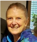
Bethel Shields Churchill Memorial