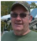
Mike Albert House in the Woods