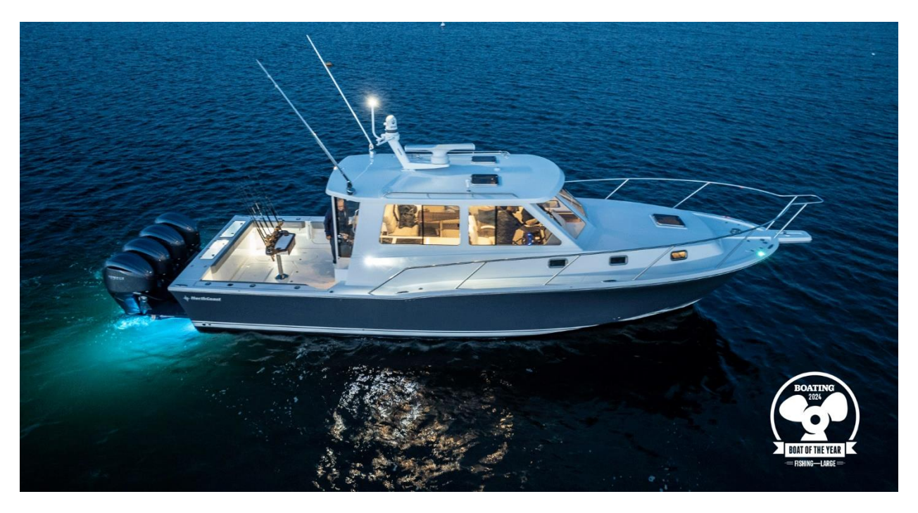
Actual Boat that will be used.

Sunset Cruise with licensed captain. Enjoy a cruise on Mt Hope and Narragansett Bay and venture out to newport. Enjoy dinner and drinks as the sun sets over our beautiful harbors. Dinner and drinks provided.