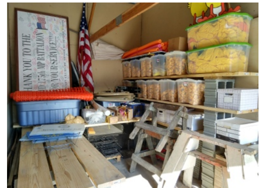
Before is above. After, to the right.

CONTINUED ON PAGE 2 - NEW YEAR'S EVE PARTY!