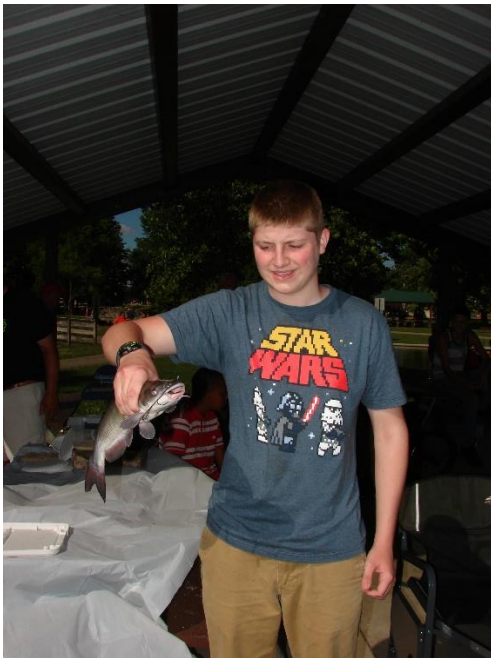
A Successful Contestant