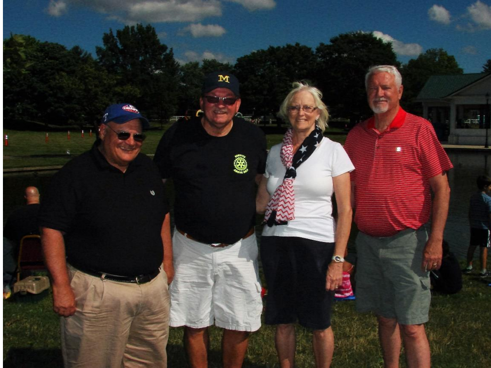
Rotarians (and a Spouse) At Work

There were 26 Chalk Drawing participants, with some great art work produced. And approximately 50 kids in the bike parade.