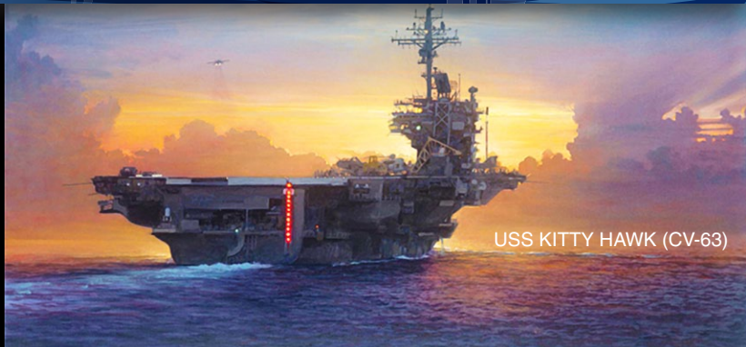
USS KITTY HAWK (CV-63)