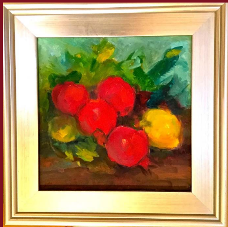
The painting is an original, one of a kind, oil on canvas (unvarnished) painted in 2016. It is untitled. It measures 12X12 in. and the wooden frame is finished in a silver color.