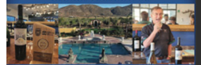
THE VALLE DE GUADALUPE: THE NEW DARLING OF THE WINE WORLD