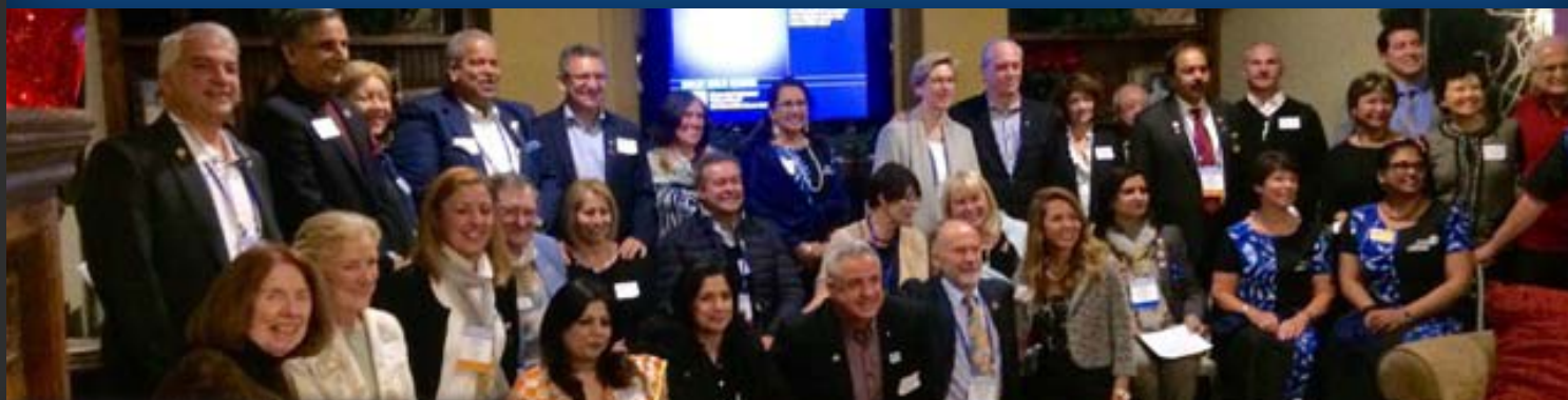
FIRST WOMAN IN PAKISTAN HISTORY TO BE A DG