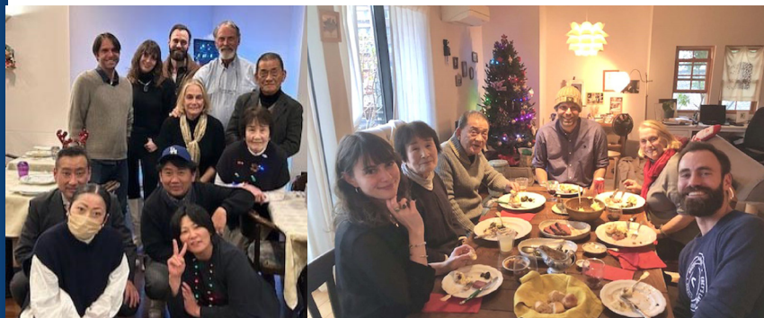
We enjoyed our Christmas festivities in Japan with our Japanese family.