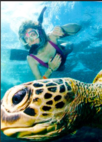
I survived a swim with a GIANT Turtle!

As you can see by the picture, I love being in the water! Whether it is snorkeling or boogie boarding, scuba or even just sitting at the beach and watching the waves, I thoroughly enjoy being around water. This picture was taken at the Great Barrier Reef by a professional photographer. The turtle just happened to swim between us when he was taking pictures - I had to buy it! How else could I prove that I survived a swim with a GIANT turtle... I have snorkeled in many beautiful places including the Great Barrier Reef, Hawaii, St. John and St. Thomas, Carriacou (a tiny island in the Grenadines) even in Bali...The colorful coral in the GBR is beautiful ~ but the multitude of beautiful fish in Hawaii can't be beat. My favorite local spot is La Jolla Cove, early AM before the waves come in. The water is still and you can easily see the garibaldi. I once saw a manta-ray at the Cove ~ it was definitely time to leave!