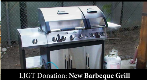
LJGT Donation: New Barbeque Grill