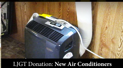
LJGT Donation: New Air Conditioners