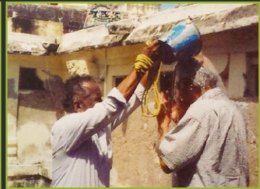
We performed the ritual of bathing in the water of each of the 22 Kunds (water tanks). Each Kund has a special benefit.