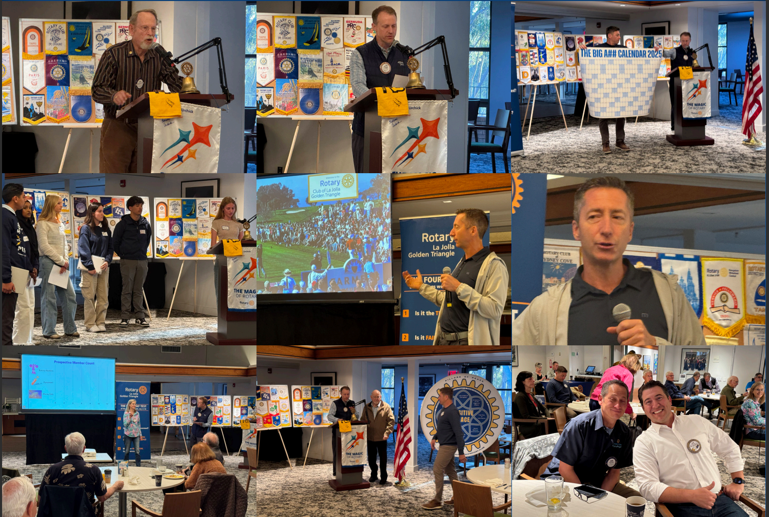
Partner's Therapeutic Horsemanship