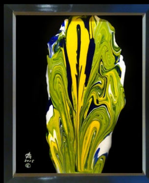
Amazing Grace acrylic on canvas 16 X 20 • 2015