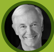
Bill Keane Photographer