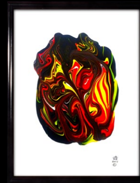
Phoenix acrylic on canvas 18 X 24 • 2015