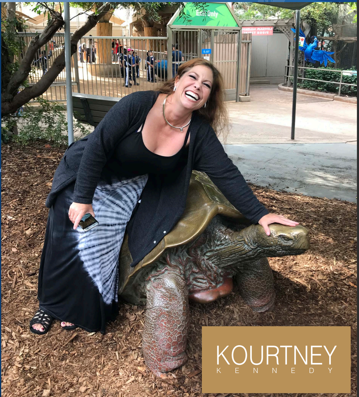
KOURTNEY K E N N E D Y