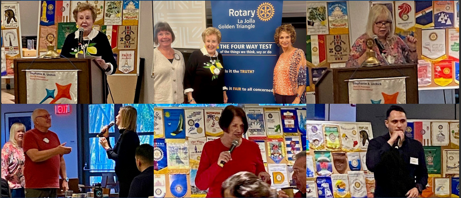
Rotary Coffee with The Boss