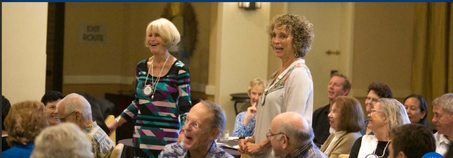
FRIDAY BREAKFAST MEETINGS AT THE LA JOLLA MARRIOTT