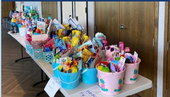
Easter basket project