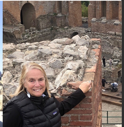
Visiting the Ancient Theater of Taormini, Sicily