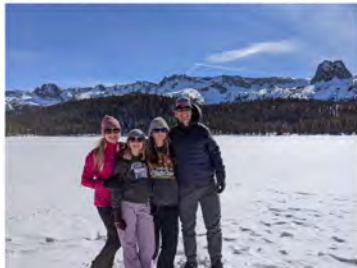
Pandemic friendly Viking family Outdoor Adventures