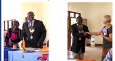
The Rotary Club of Moshi