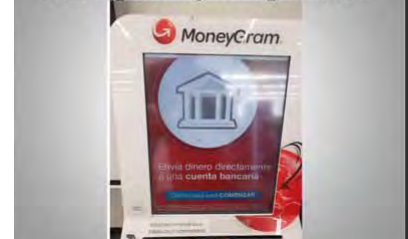
Sending money to Afghanistan