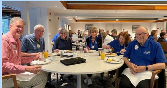
Promote Demote Party