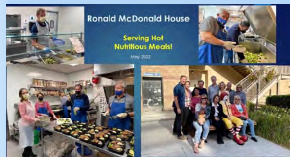
Ronald McDonald House