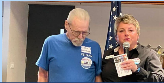
Rotary DTA 2023