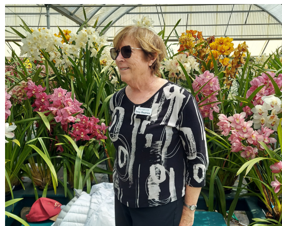
Dory at The Flower Fields

After all these years, she still has great admiration and respect for what Rotary is and what it does in the world.