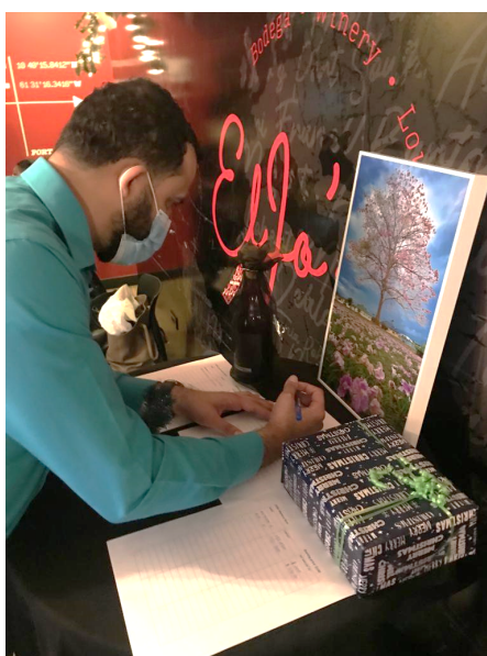
Rotaractor participating in auction