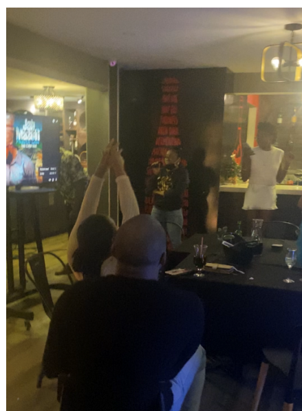
Rotaractor participating in karaoke