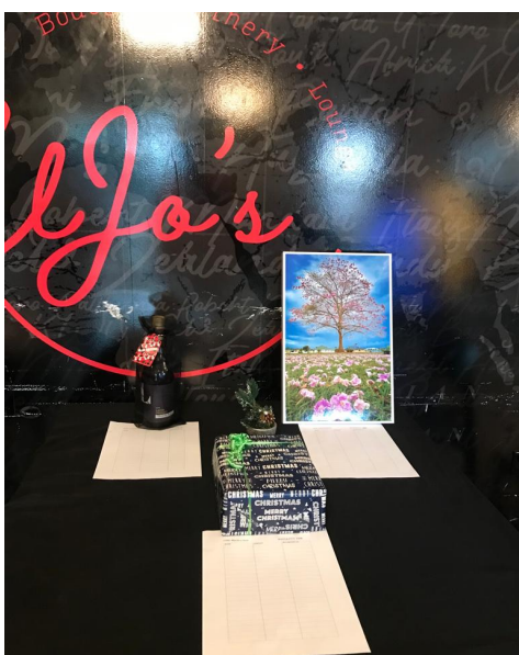
Three (3) Auction Items on display at El Jo's

Jingle Bell Rock – Karaoke and Auction Edition was a project initiated to create and disseminate the Christmas spirit. Members of the Rotaract Club of Maraval, Diego Martin and Port of Spain West were able to safely mix up and blend this spirit by creating a space to sing karaoke, wear ugly and fun Christmas sweaters and play various games. Consequently, despite the difficulties to participate in traditional Christmas events due to the pandemic, this project allowed these Rotaractors to experience some form of normalcy and enjoy the Christmas season. Additionally, the auction was a great success and garnered interest from everyone at the event. In total, three items were auctioned: a homemade wine, a scenic picture on canvas and a mystery item. Two (2) out of the three items were donated and so a 100% profit was made from the auction. These funds will go towards the Club Disaster Relief Fund. Though it was a goal to obtain additional items to auction, the target of attaining a profit was greatly surpassed, and the Rotaract Club of Maraval is thankful for the invaluable help and support. The Rotaract Club of Maraval wishes to thank all participants and we are looking forward to more successful events such as this one.