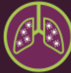
SEVERE ACUTE RESPIRATORY SYNDROME