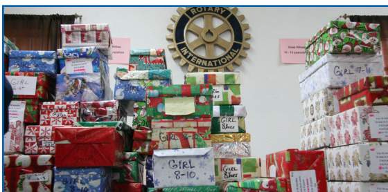
Every year giving gifts to the children in Mexico and giving food staples to the mothers warms our hearts!