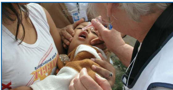
Polio vaccines given to babies in Mexico.

These are some of the ways Pantano Rotary Club impacts lives locally and internationally: