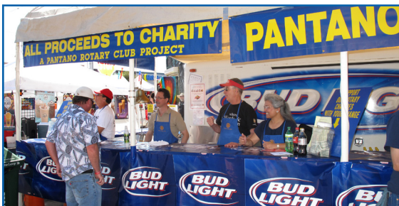
Twice a year Pantano Rotary Club has a booth at the 4th Avenue Street Fair in Tucson, AZ.