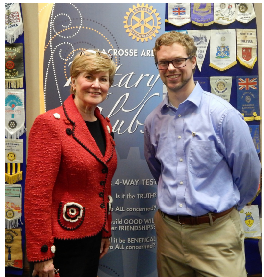
100 Years of Service Above Self

88. In 2016, the Rotary Club of La Crosse gave a $1,000 check to Operation: River Watch, a campus-driven organization that has curtailed several drownings around Riverside Park. Founded in 2006, student volunteers from UW-La Crosse, Viterbo University and Western Technical College patrol the Mississippi River along Riverside Park during the academic year, Thursdays through Saturdays, from 11 p.m. to 3 a.m. The three schools partner with the La Crosse Police Department and the Radisson Hotel.