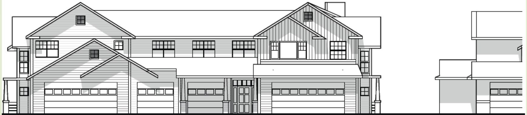
1 MISSISSIPPI ST Scale: 3/32" : 1'-0"

This drawing is not intended to be used for contract pricing or fabrication purposes. All content is subject to change