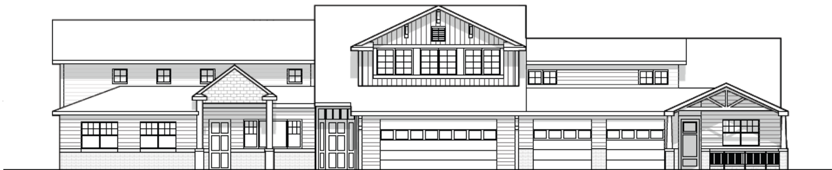
1 5TH AVENUE Scale: 3/32" = 1'-0"

This drawing is not intended to be used for contract pricing or fabrication purposes. All content is subject to change