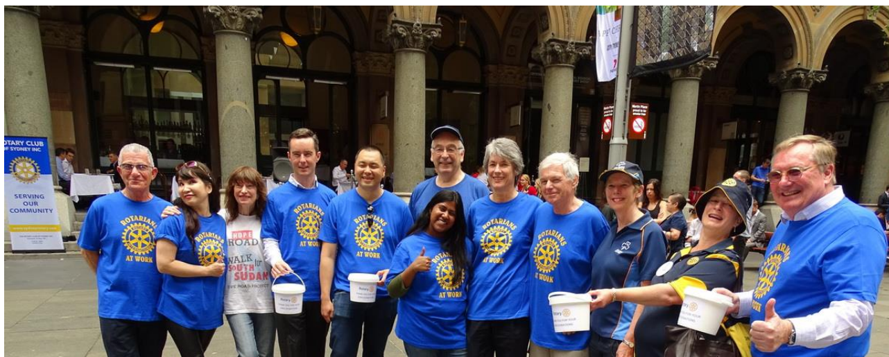
A very happy gathering in Martin Place after 'The Dance' 27 th November 2015