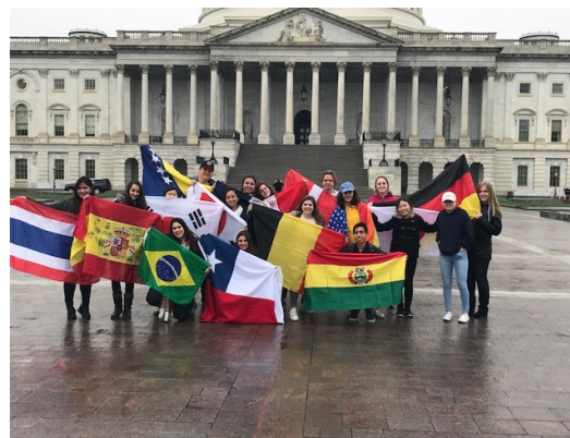
17 Exchange Students from 5 Rotary Districts toured Washington DC this Past month...

Mission Statement – To enrich the lives of children and adults with special needs throughout Cape Cod by providing life enhancing opportunities through therapeutic riding & equine assisted activities. 235 Run Hill Rd, Brewster, MA 02631 508-896-0064