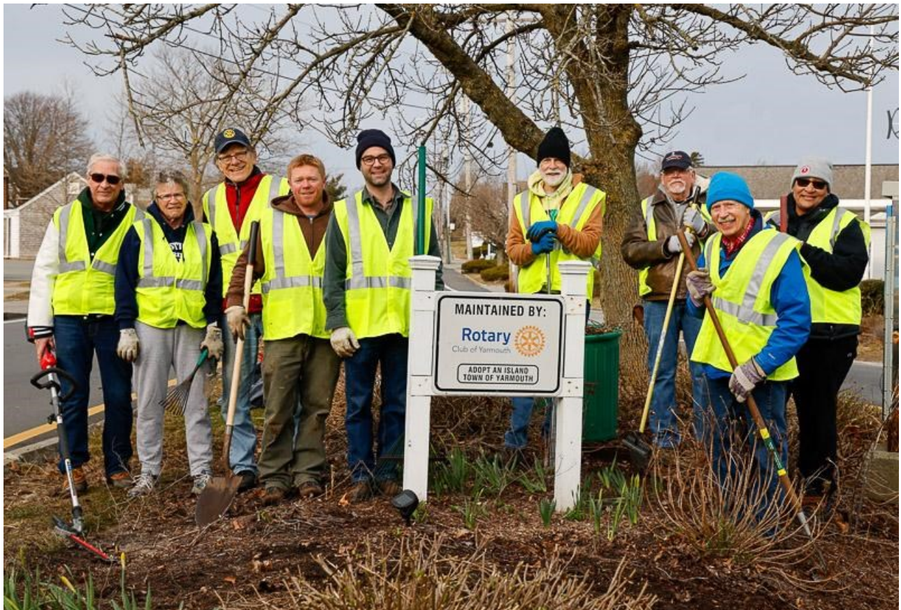
BAKERS SQUARE CLEAN UP CREW FROM YARMOUTH ROTARY AND COMMUNITY CONNECTIONS

Saturday December 16 – Wreaths Across America