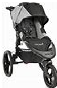
Baby Joggers & Strollers