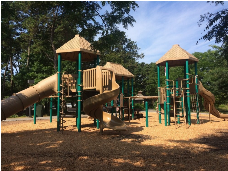
Peter Homer Park