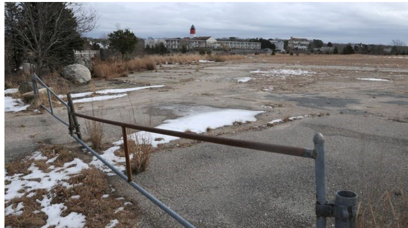
The Old Route 28 Drive In