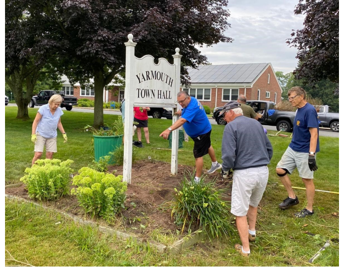
CLEARING AND LOOKING FOR THE BEES