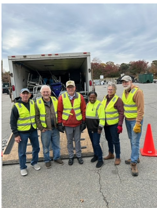
Loading the Truck with Mobility Devices for CRUTCHES FOR AFRICA