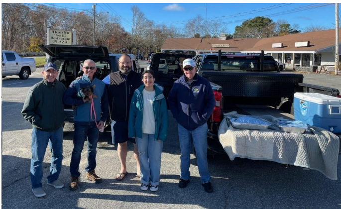
(Top Left) Collecting Food For the Annual Champ House Thanksgiving Dinner