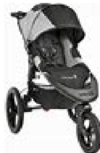
Baby Joggers & Strollers