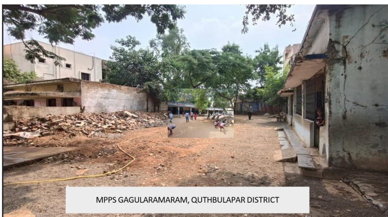
MPPS GAGULARAMARAM, QUTHBULAPAR DISTRICT