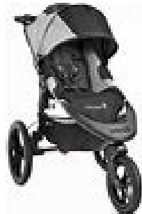
Baby Joggers & Strollers